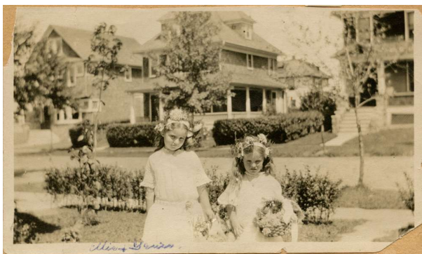
Getting ready for the Children's Parade (1914)

Check out the link below to access our digital photo archives documenting some of the activities during the original event in 1914.